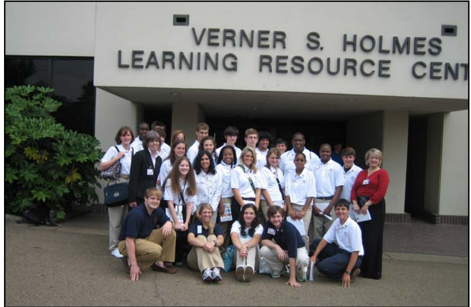
The 2007 Rural Medical Scholars in front of the Learning Resource center at UMMC

Program recruitment begins early in the year. Each of the state's 15 community colleges selects and sponsors two candidates from their district. Candidates must