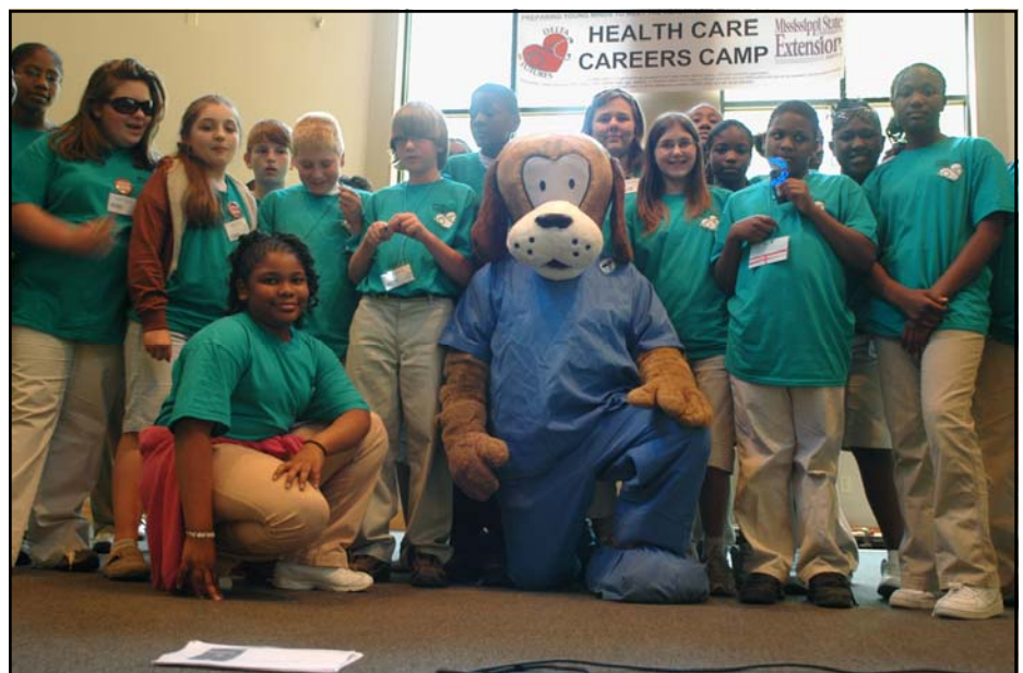
Delta Futures campers posing with Howie the Hound from the Mississippi Hospital Association

form partnerships with communities, states, educational institutions, and professional organizations to provide opportunities and professional experiences to students through scholarships and loan repayment in exchange for working in a medically underserved area for a specified period of time.